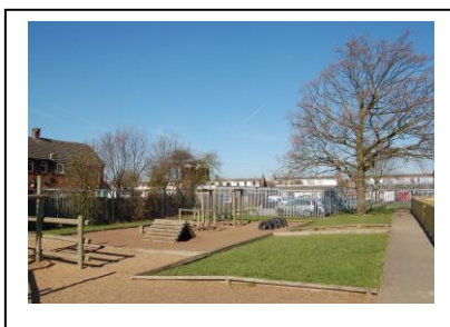
KS1 log area