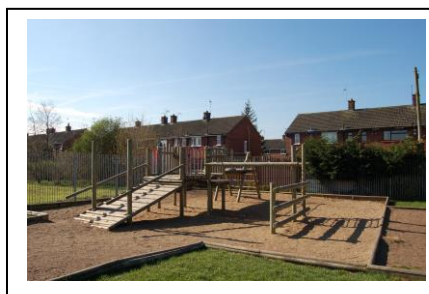
KS2 log area