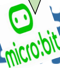
Upton Westlea Primary School Curriculum Road Map – Computing