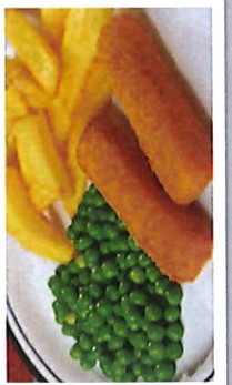
Fish Fingers served with Chips & Peas or Baked Beans

VEGETARIAN VERSIONS OF THE ABOVE MEAL AVAILABLE DAILY